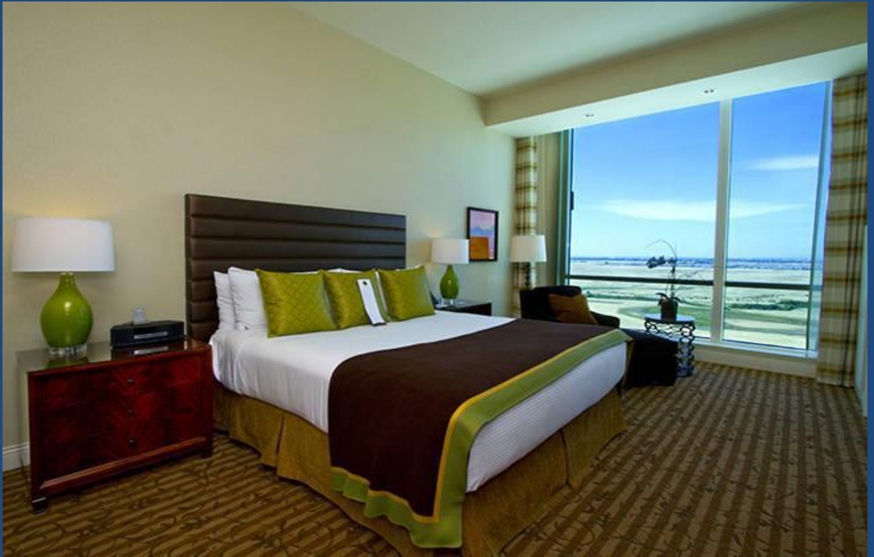
Deluxe King/Queen Room (Specify bed type at time of reservation)