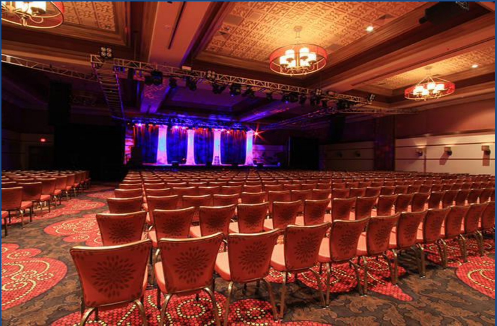
General Assembly Room and Dining Area 2012 FDSTL Conference April 27 – 29, 2012